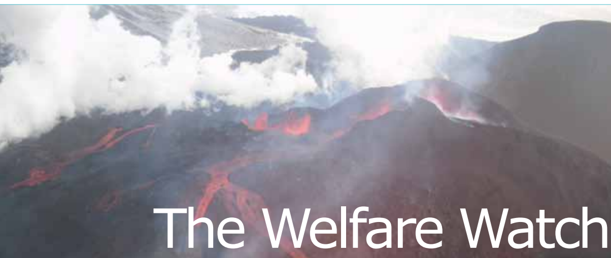
Volcanic eruption in the Eyjafjallajökull-area (3 April 2010)