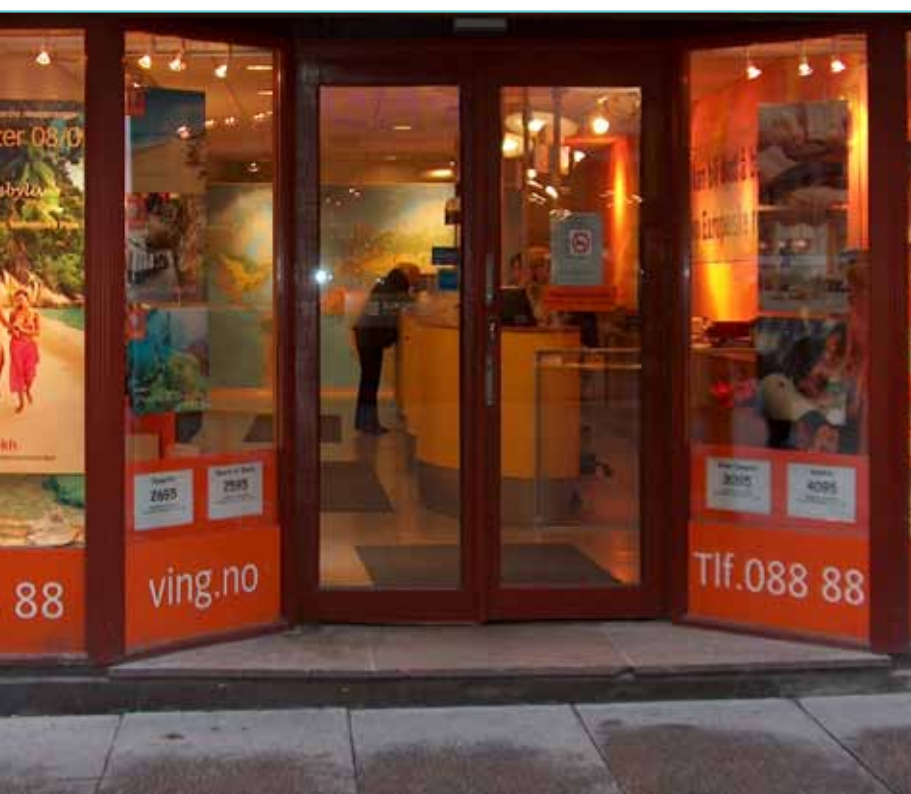
The Ving office in central Oslo was the first case tried according to the new law.

Ving argued that they are not discriminating against wheelchair users as there is another shop 500 metres away which everyone can get into. The Equality and Anti-