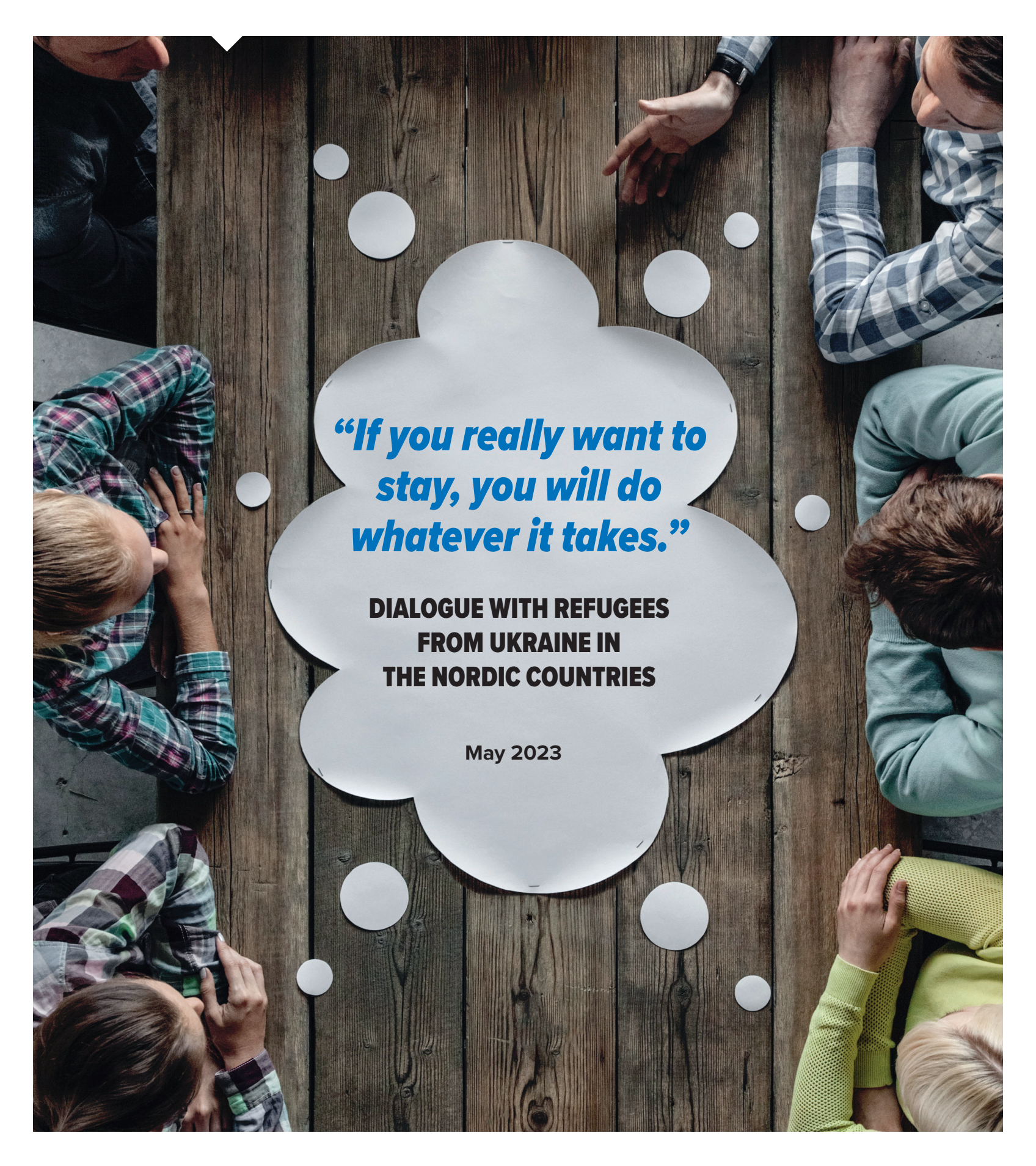
Findings of Focus Group Discussions in Denmark, Finland and Sweden